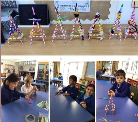
Our Eiffel Towers turned out great!

We had a lovely time during our French enrichment week last week. All the children created artwork based on Monet's work; created Eiffel Towers out of Lego, newspaper, straws and even spaghetti and marshmallows; sung French songs and learnt French stories; and we all got to taste some French food. We even baked our own delicious French bread!