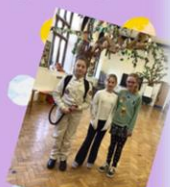
Ghostbuster Doodle Blossoming