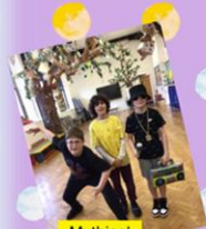
Mythical Cheese Rapper